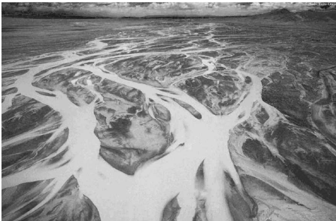
Bottoms up: The source of drinking water for two billion people.

year. The situation has become so severe that Peru, once 80 percent dependent on hydropower, has now had to build coal-fired plants to make up for the shortfall in its power output during the dry season, when its hydroelectric turbines run as low as 20 percent of capacity. Everywhere Thompson goes, he finds glaciers shrinking, retreating, and thinning at faster rates than he originally imagined.